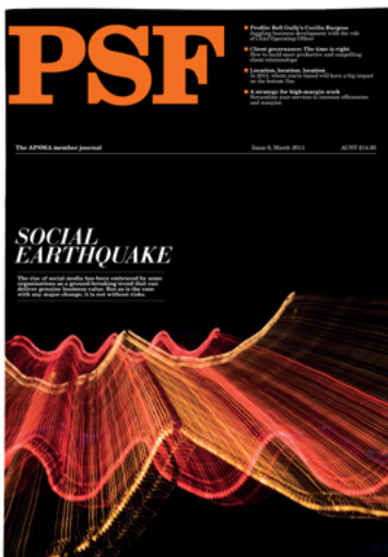
March 2011 edition

Launched in 2008, PSF Journal is published by Editor Group, one of Australia's most respected editorial service firms, for the prestigious Asia-Pacific Professional Services Marketing Association (APSMA). It is designed by leading Sydney firm Folk.